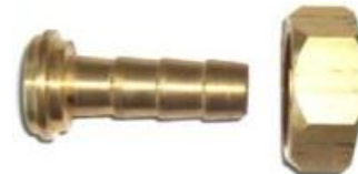
Part # 22 Part # 25

Available sizes : 1/2, 5/8, 3/4" (12.7, 15.9, 19 mm)