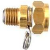
Size – 3/4" Garden hose thread (for water-saver spray nozzle)