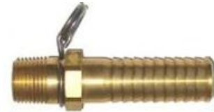
Sizes – 1/2, 5/8, 3/4" (12.7, 15.9, 19 mm) ID hose (for water-saver spray nozzle)