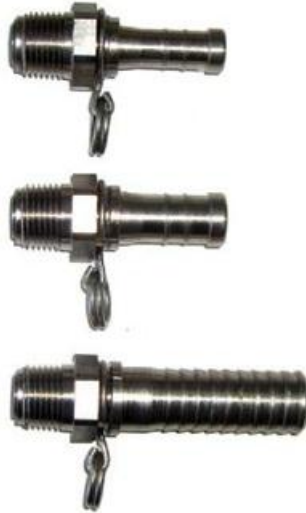
Part # S21S – Stainless steel swivel adapter