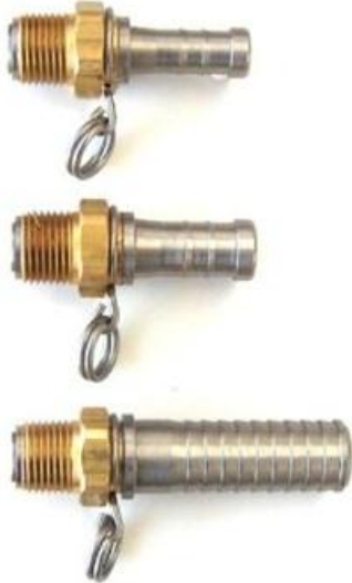
Swivel – 1/2, 5/8, 3/4" (12.7, 15.9, 19 mm) ID hose (for water-saver spray nozzle)